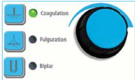
Coag Mode Controls on Aaron 1250™

The second clinical mode of electro-surgical units is coagulation. There are two types of coagulation: Coagulation (also known as pinpoint) and Fulguration (also referred to as spray). They differ primarily in how they are applied. To apply pinpoint coagulation, the surgeon holds the electrode in physical contact with or against the tissue.