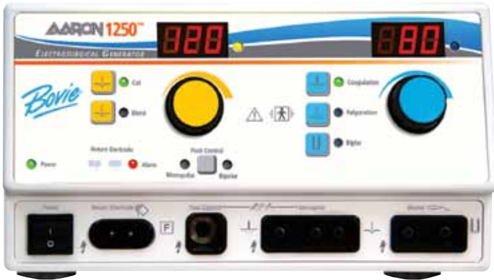
The Aaron 1250™

An ESU, by definition, is a generator capable of producing a cutting and/or coagulating clinical effect on tissue by the use of alternating current at a high frequency (RF - radio frequency, also known as radio surgery). Voltages and currents may vary depending on the desired clinical effect.