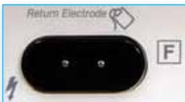
Return Electrode Cord Receptacle

through the patient, exiting by way of the return electrode. It returns to the generator to complete the circuit. Without complete circular path, from generator to patient, back to the generator, the current should not flow.