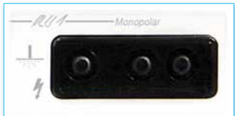
Monopolar Handpiece Receptacle on A1250™

In monopolar electrosurgery, tissue is cut and coagulated by completing an electrical circuit that includes a high-frequency oscillator and amplifiers within the ESU, the patient plate, the connecting cables, and the electrodes. In most applications, electric current from the ESU is conducted through the surgical site with an active cable and