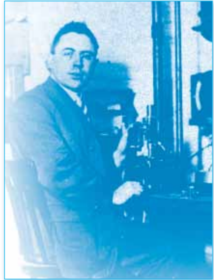
Dr. William T. Bovie

The work at Bovie/Aaron continues today to improve the performance of electrosurgery, but our sincere thanks go out to Dr. Cushing and William T. Bovie for their incredible invention.