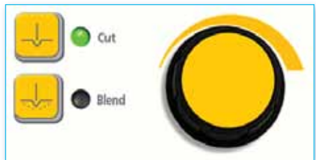
Cut Mode Controls on Aaron 1250™

The first clinical mode of a modern ESU is cutting. The unit offers the surgeon two types of cutting: pure cut and blended cut. Pure cut is used for dissection only. Blended cut adds some hemostatic effect. In pure cut the instrument performs much like a stainless steel scalpel, in that the surgeon has little or no control over bleeding. There are, however, some notable differences.