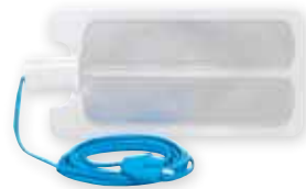
Split Grounding Pad with Cord

Current leaves the body via a dispersive electrode (grounding pad). The pad has a large surface area thus the current density is quite low. As long as this large, so-called “dispersive” electrode makes good contact with the skin it should offer a passage of least resistance for safe exit of the RF current from the patient. The large surface area generates little heat, thanks to the low current density. A generator supplies RF to the active electrode. Current passes