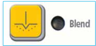
Blend Mode Selector on Aaron 1250™

In addition to the pure cut, most ESU's today offer a blended cut. The term "blended" does not refer to a blend of currents, but rather a blend of surgical effects. The blended cut permits the surgeon to cut and coagulate at the same time. In a pure cut the heat energy is so great that cells vaporize. But in a blended cut, cooling periods slow down the action to a dehydrating crawl. Cell wall explosion and vaporization are replaced by the slow dehydration of cellular fluid and protein. This stops the bleeding at the moment the cuts are actually being made. By adjusting the blend the surgeon can get varying degrees of hemostasis. A blended cut is ideal for sealing off small bleeders when cutting through soft tissue. It is also used to resect masses of tissue and to reduce and recontour redundant tissue where the cutting is continuous, but the surgeon wishes to minimize bleeding and work in a clear field.