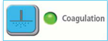
Coagulation Mode Selector on Aaron 1250™

Factors affecting pinpoint coagulation include; current density, period of contact, and surgical technique. Therefore, when using pinpoint coagulation the time that the electrode remains in contact with the tissue is important. The tip should make only light, momentary contact with the surface. Power should be adequate to deliver a desired clinical effect. The desired effect for pinpoint coagulation is to stop local bleeding. Here, an interrupted current supplies controlled dehydration. The drying out effects of a pure coagulating current produce a zone of coagulation necrosis that is limited to the surface layers of the tissue.